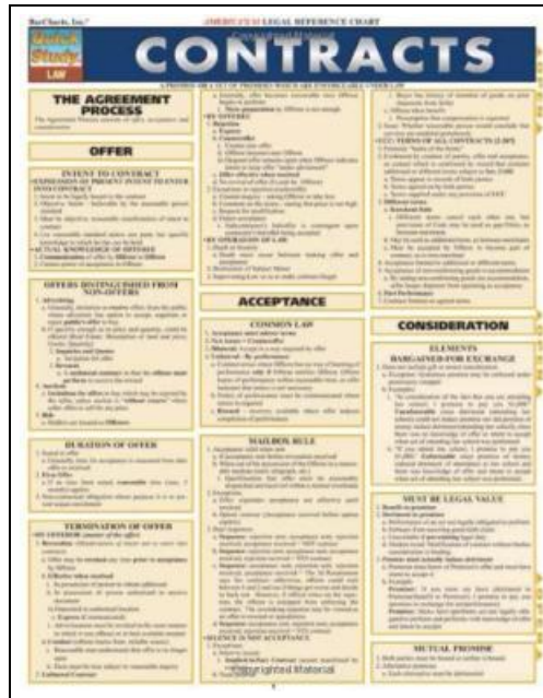
Filesize: 1.56 MB