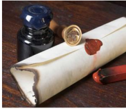
FOOD INVESTIGATION, VOLUME 4